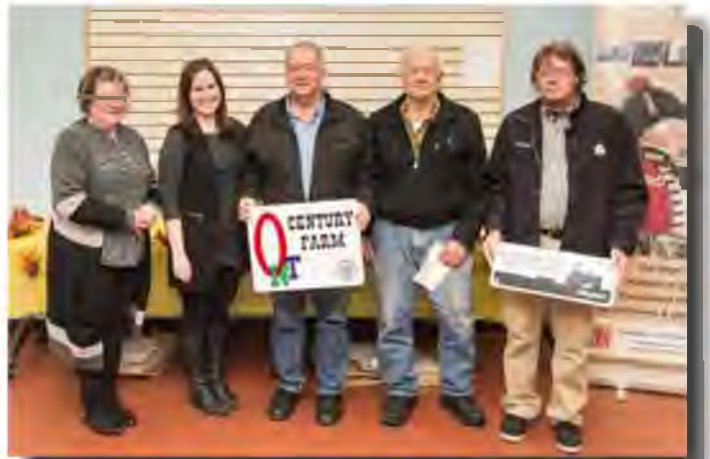
The Dawson Family receiving their Canada 150 and new Century Farm signs.