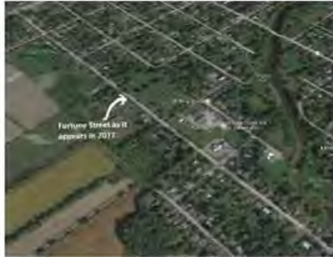
Fortune Street, Richmond Ontario