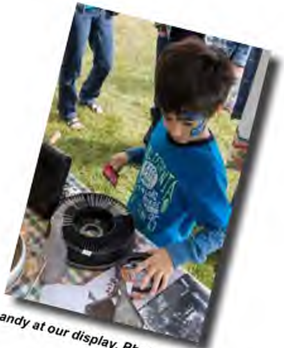
Kids and candy at our display.