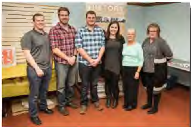
The Goulbourn Township Historical Society and Junior Farmers of Ontario team.