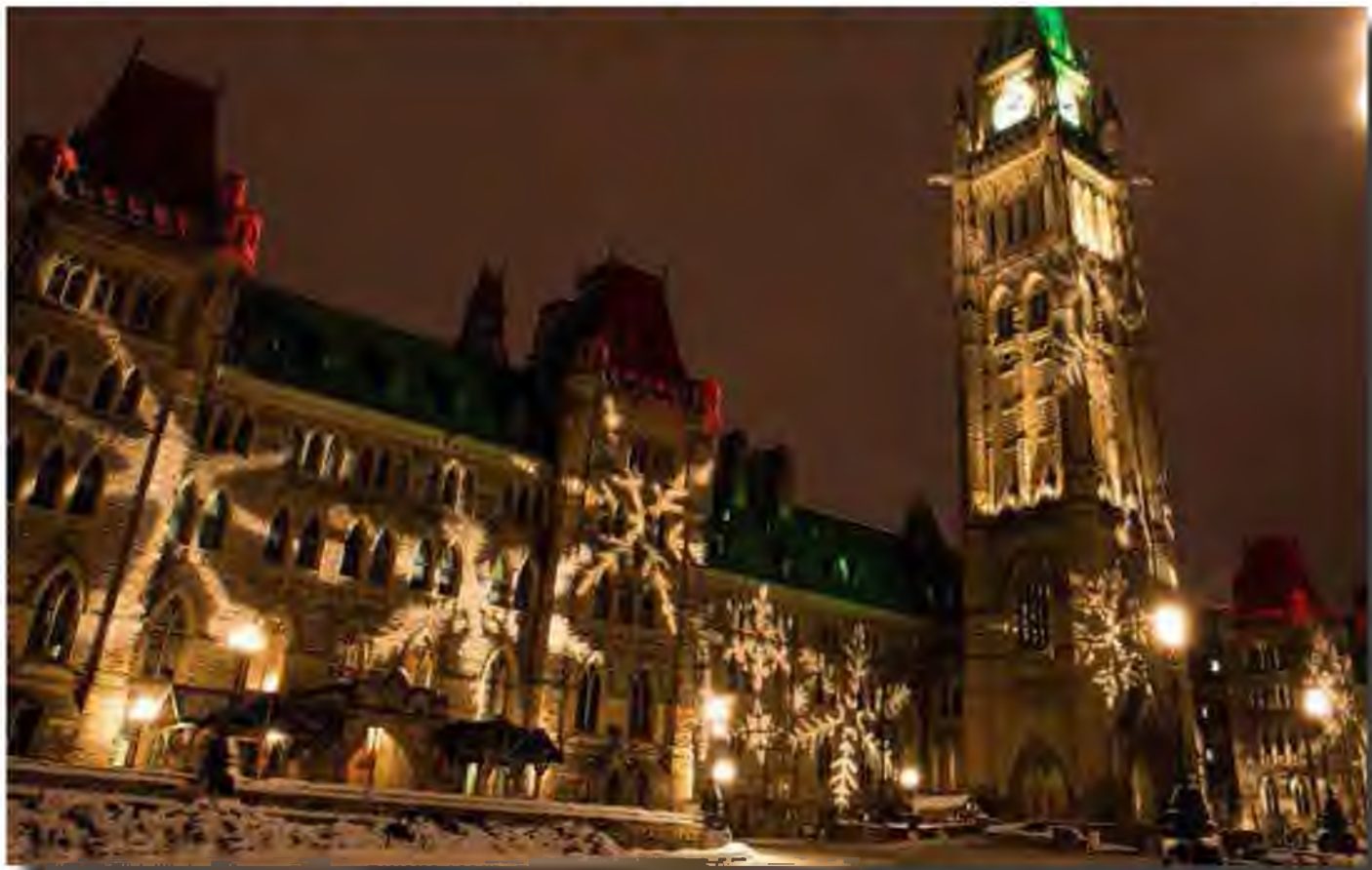
Parliament Buildings Lit Up For The Christmas Season