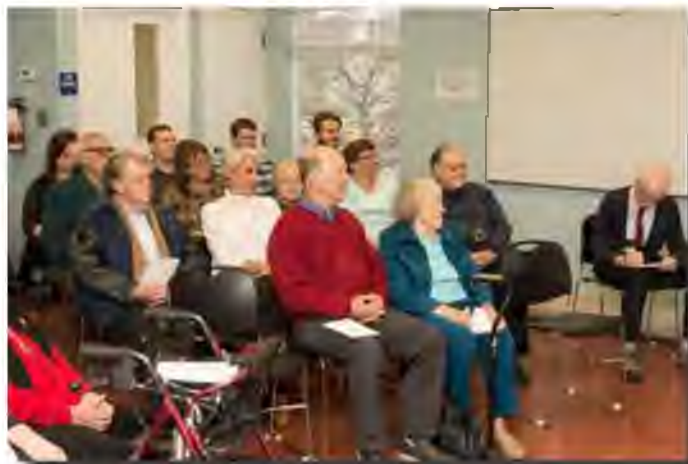
More attendees at the Sesquicentennial Farm Families Reception.