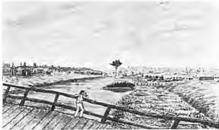
Richmond, 1830. Artist unknown.