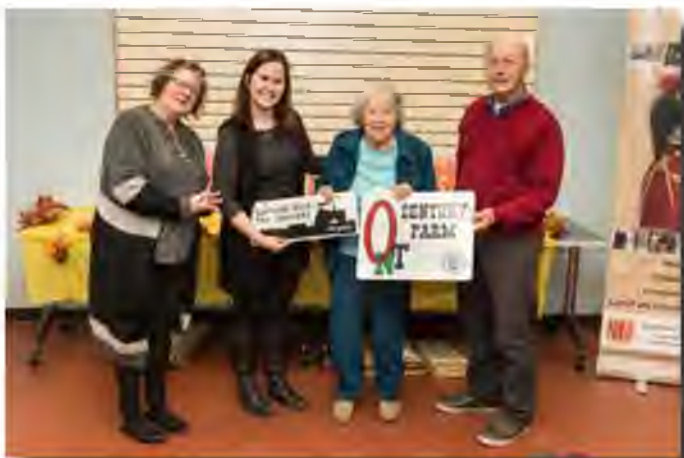
The Hobbs Family receiving their Canada 150 and new Century Farm signs.