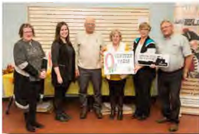
The Kenny Family receiving their Canada 150 and new Century Farm signs.