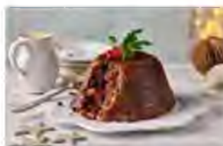
Cranberry Snowball Pudding (From the Winnipeg Free Press - 1914)

This is a nice change from heavier puddings.