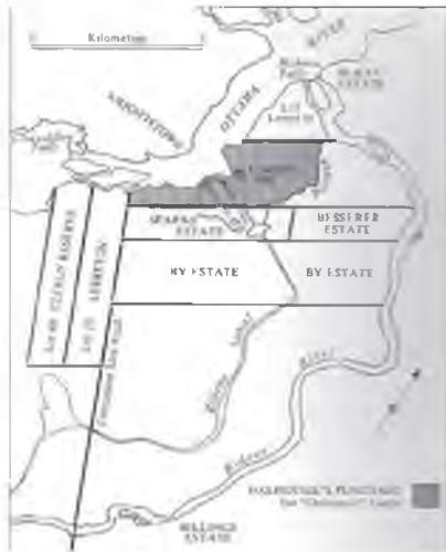
c1870 Ottawa map showing the Sparks land