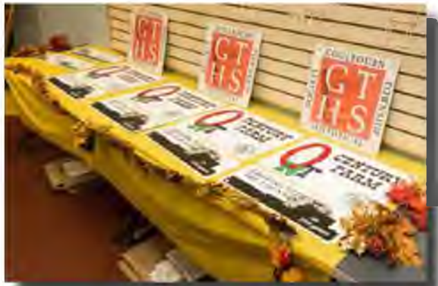
The Century Farm and Canada 150 signs that were given to each farm family on November 25th, 2017.

On November 25, GTHS was proud to honour our local Sesquicentennial farm families at a Reception. In collaboration with Junior Farmers of Ontario, a presentation of Canada 150 farm signs were presented to each family in recognition of their long-serving commitment to their land and the farming industry. The event was well attended to mark this historical significance of agriculture and families in the former Goulbourn Township.