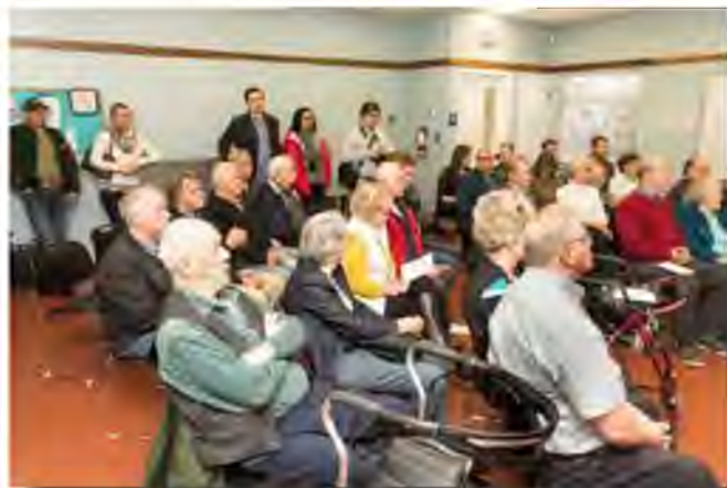
Attendees at the Sesquicentennial Farm Families Reception.